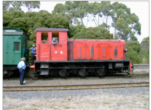
Getting ready to couple up. Diesel power is used on weekdays, steam power on weekends.