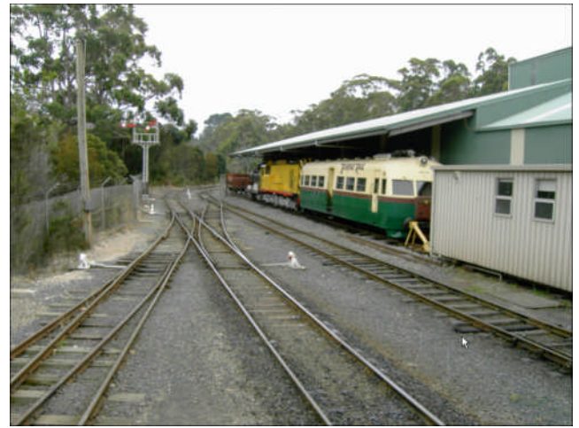
Here is a view (station behind us) of the 'mainline' on which the museum train runs. The railcar in the foreground is operational and is used to transport passengers into and out of the city of Burnie during summer weekends as a way to get into the city for a farmer's market and various festive events.