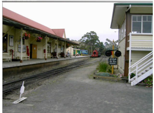
Here's a view of the diesel-hauled museum train arriving in the Station which was donated by Australian Railways from its former site in Uiverstone.