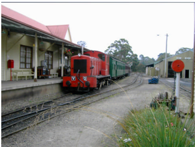
The train arrived. Next move: have the diesel loco run "round the train for the next trip.