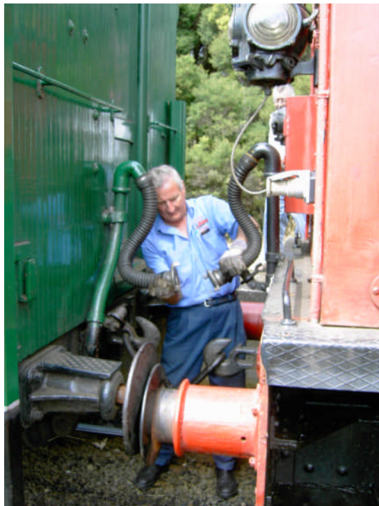
Coupling up the vacuum brake hose, note the buffers and the hook-style couplers. For further details, the website is www.donriverrailway.com.au