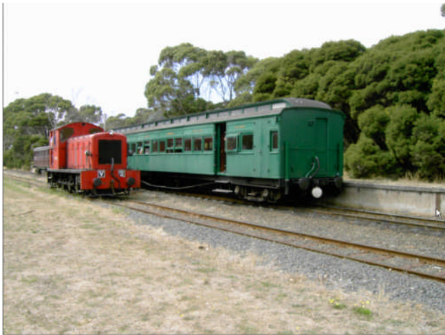
Running around the train at the other end of the line.