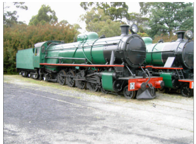
One of a number of steam locos, here a 4-8-2, on site.