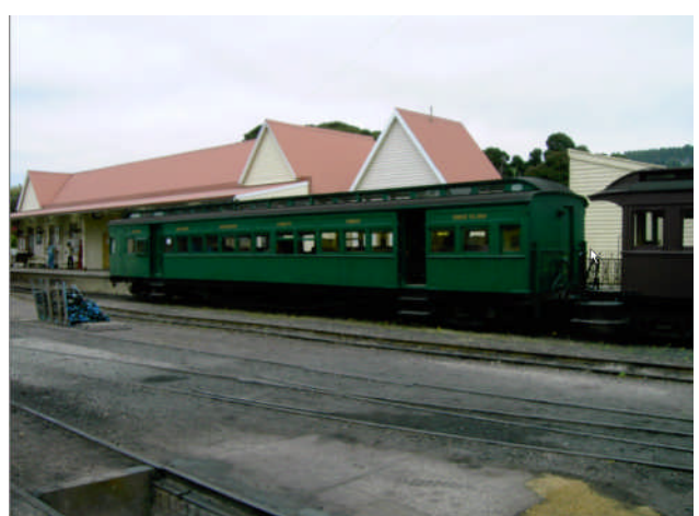
That having been done, here is (now) the last passenger car (coach) for the next outward trip. Notice the much older care before it.