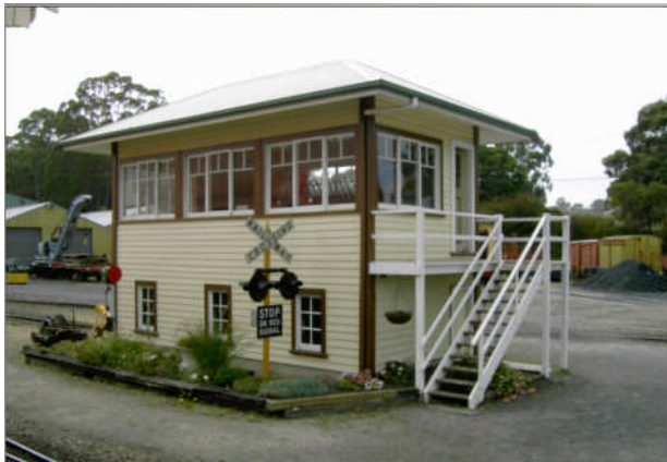
This signal box was donated by the Australian National Railways from its former site in Devonport to the museum and re-erected in 1984. Plans call for the signal box to be in full working order to serve as a museum of signaling and communications equipment.

Located in Tasmania near the city of Devonport, the operation has garnered strong support from the City as well as the Tasmanian Government with Tourist Development Grants for new buildings and other works.