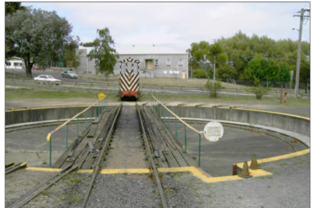
The turntable was donated by the Australian National Railways having previously been operational at Antill Ponds and Branxholm. The little diesel at the far end is a real curiosity that reminds me of what one might find working in a steel mill.