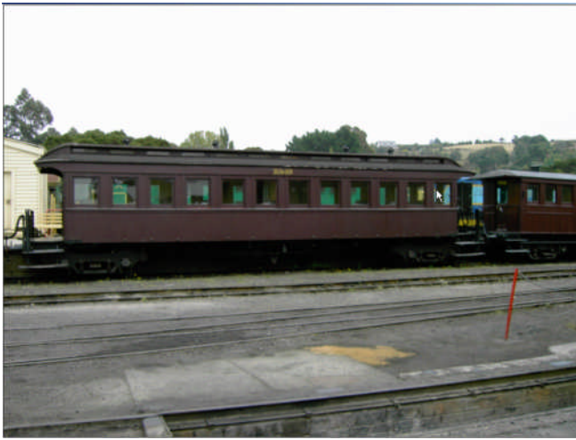
Here's that "older" passenger car with a still older one before it.