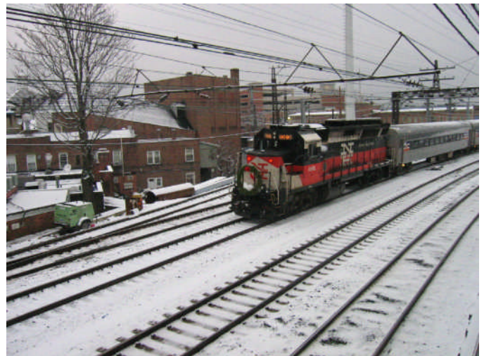
A winter scene from SS 44 window taken on Dec. 4 and the Candy Cane Express going by with the SLE #6695