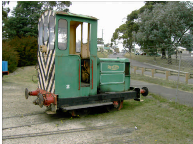
Clearly a product of British loco Builder Ruston & Hornsby. This is quite an oddity!