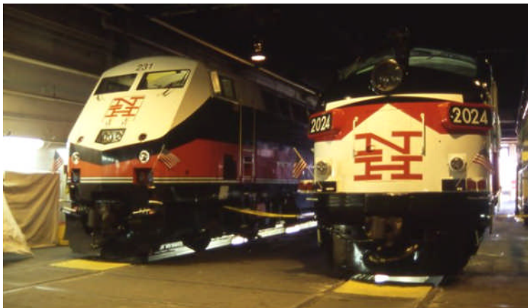
New Haven diesels in Croton Harmon Shops.