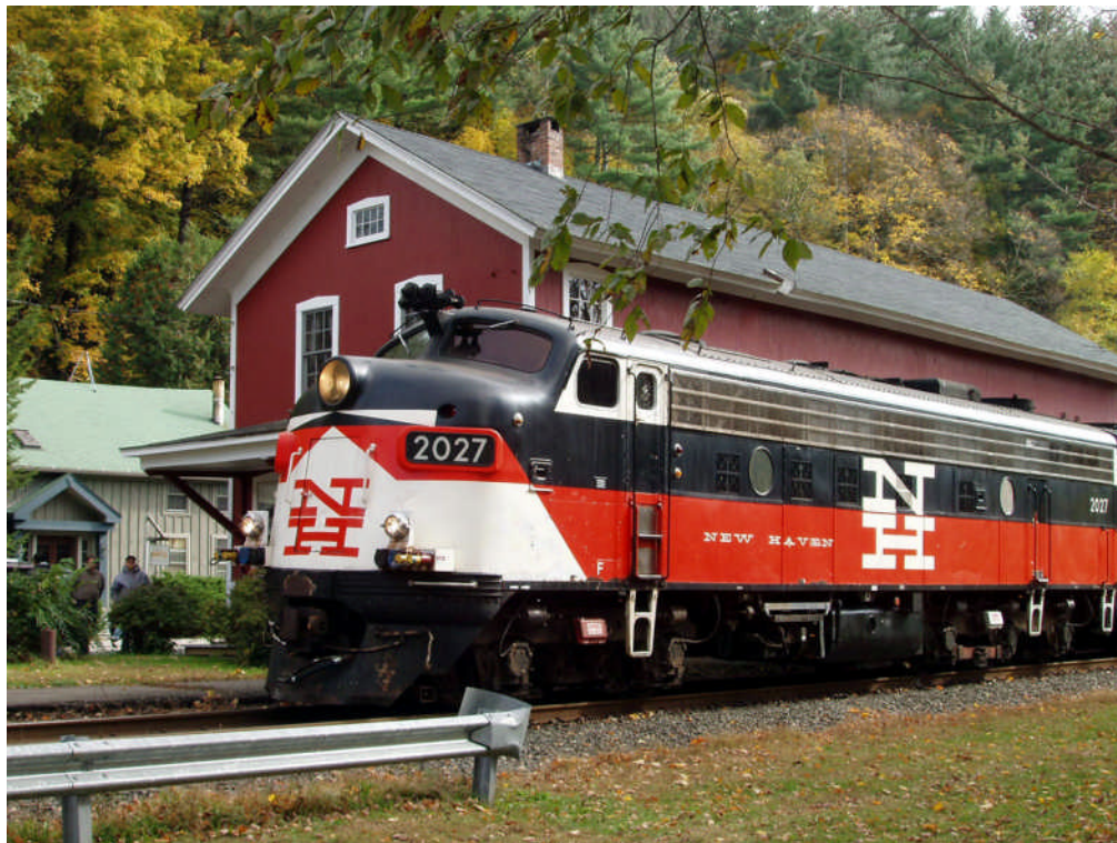
2027 at West Cornwall