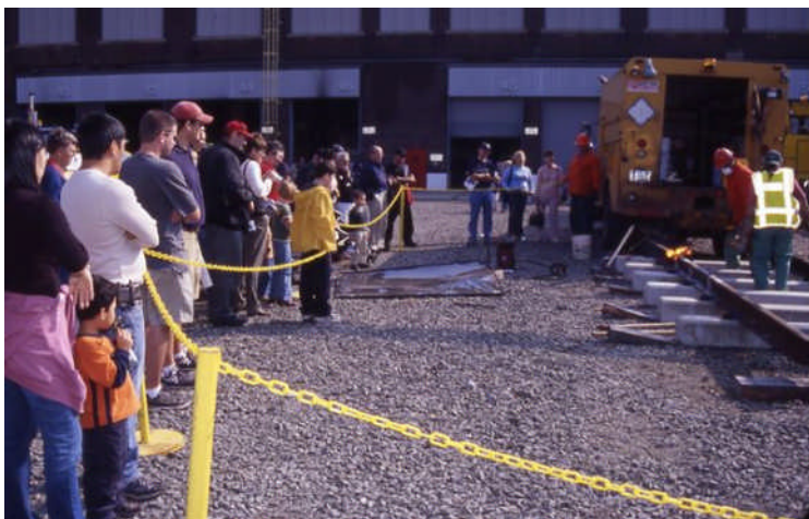
Weld rail demonstration