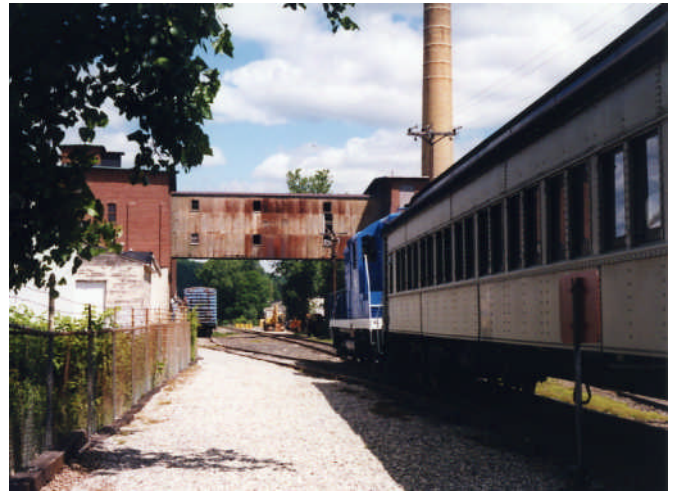
Naugatuck Trip 1998