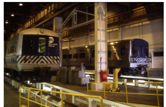
MU comparison at Croton Harmon