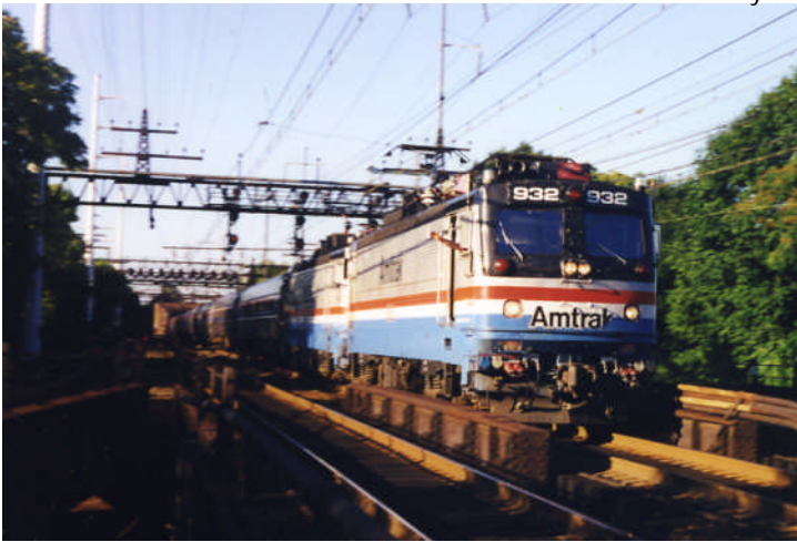
Double header AEM 7's w/ corridor train at South Norwalk