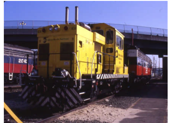
Brookville Mining Unit at Harmon