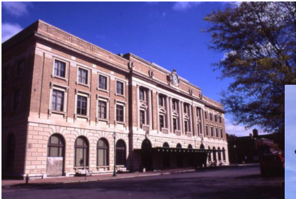
Utica, New York Station 2004