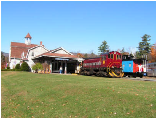
First stop -Hobo Railroad Lincoln, NH