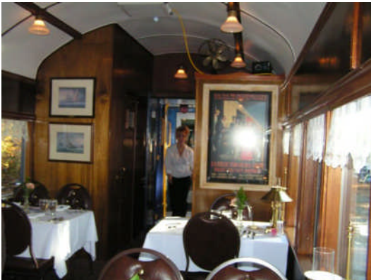
Café Lafayette dinner train along the Pemigewasset River