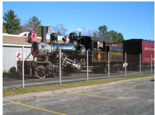
Climax engine on display at Clarks Trading Post