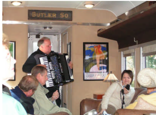
President's car on the Winnepesaukee Railroad