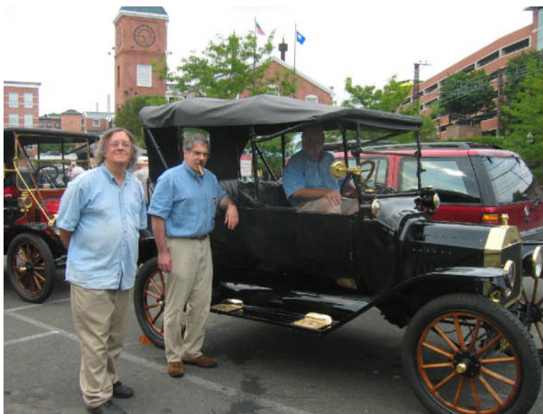
Could this be "Westconn 1" the new Presidential Limo?