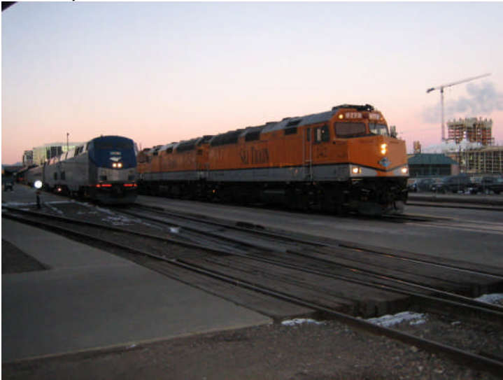
Denver Winter Park Ski Train At Union Station awaiting the highball to depart to Winter park.