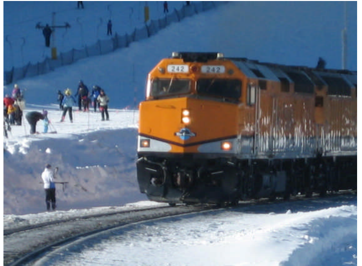
This train runs round trips on winter weekends from Union Station to that fabulous ski area.