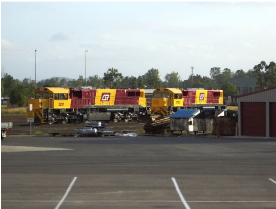
Queensland (Australia) Railways diesels at Redbank

There is a large number of Diesels at Redbank, redundant because of newer types being introduced. Over the last few years QR has sold many to Tasmania, New Zealand, South Africa, south east Asia and South America. Many Diesel-hydraulic locos have been sold to sugar mills in Queensland and re-gauged to 2 feet for their lines - look a bit ungainly.