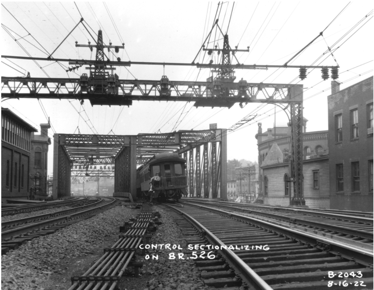
South Norwalk, CT. Note Tower 44 on left.