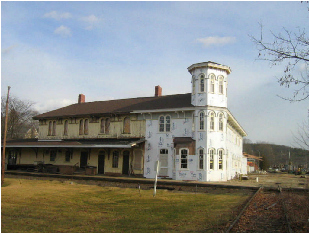
Canaan, CT station reconstruction Jan. 9, 2007