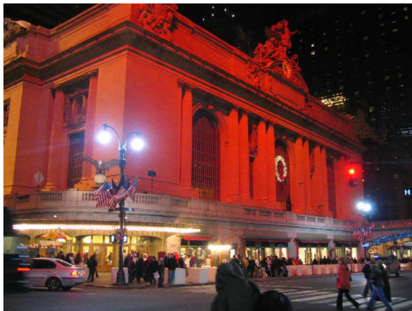
of Grand Central Terminal - Saturday December 10, 2005.